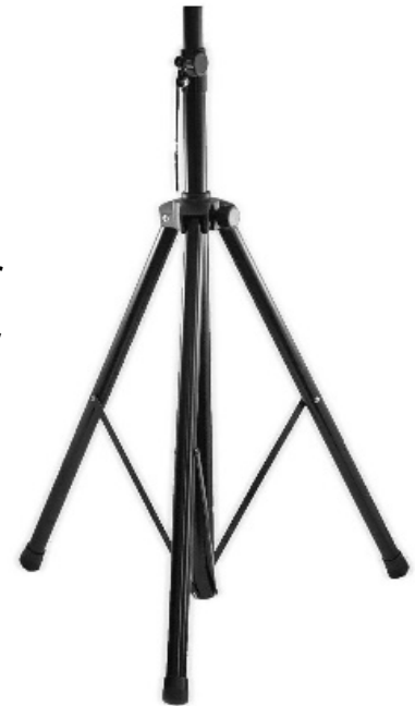
Whirlwind Speaker Stand Model# STNDSS

Speaker Stands Tripod Speaker stands utilize an "Adapter" that fits into the top part of the stand and will fit a Speaker with a Tripod Speaker Mount Adapter that has been fitted to the bottom of the speaker.