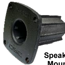
Speaker Mount Adapter

Speaker Stands Tripod Speaker stands utilize an "Adapter" that fits into the top part of the stand and will fit a Speaker with a Tripod Speaker Mount Adapter that has been fitted to the bottom of the speaker.