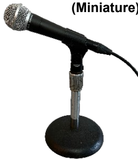
Rounded Base Microphone Stand (Miniature)