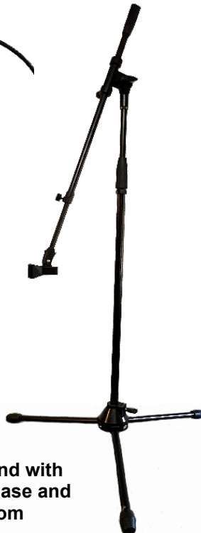
Mic Stand with Tripod Base and Boom