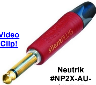
Neutrik #NP2X-AU- SILENT

The Neutrik silentPLUG automatically mutes (shorts) an instrument (guitar, bass) cable to avoid pops and squeals when plugging in / unplugging the instrument under load.