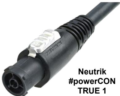
Neutrik #powerCON TRUE 1

1/4" Professional Phone Plug 3-Pole (TRS)